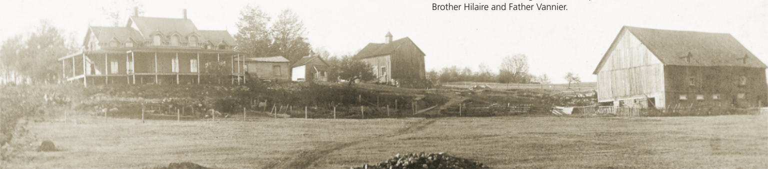
The monastery and its outbuildings in 1913