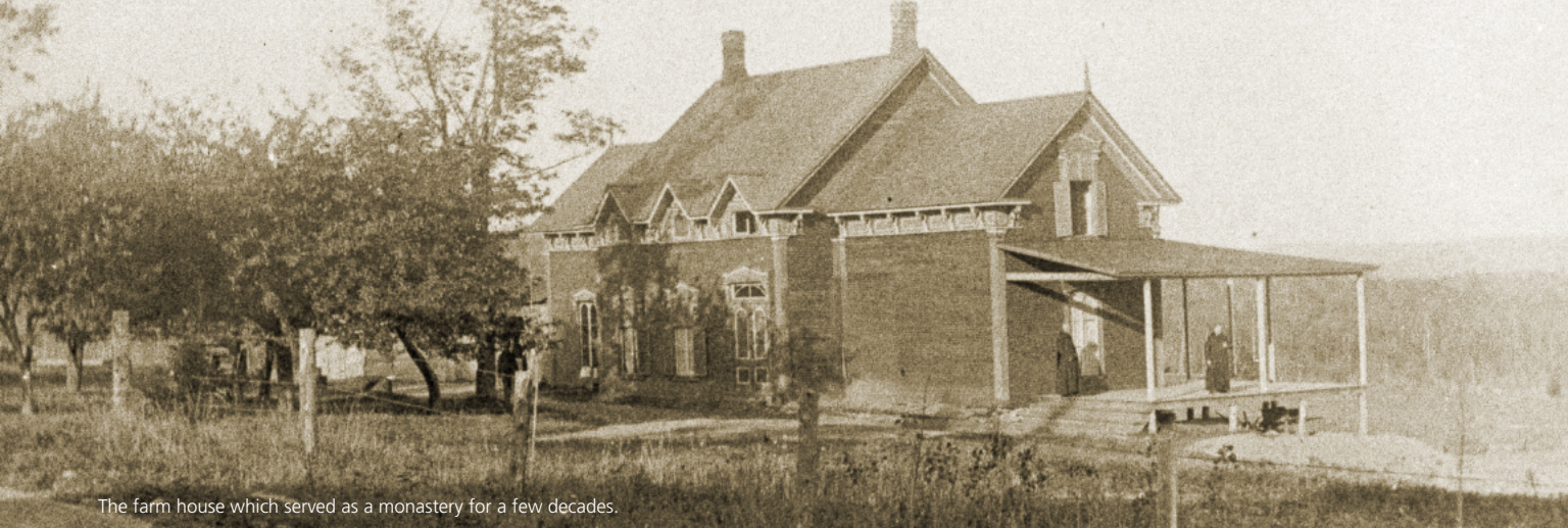
The farm house which served as a monastery for a few decades.